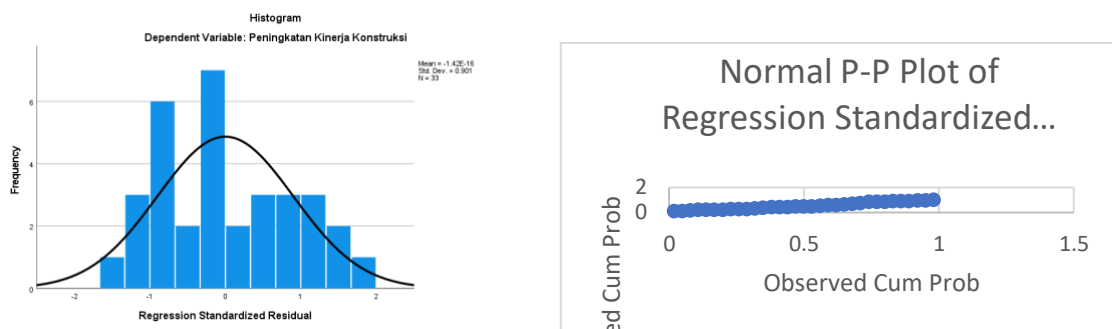
Figure 3. Histogram