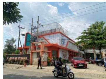
SMPIT Ustman bin affan