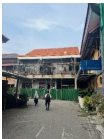
SMP giki 1